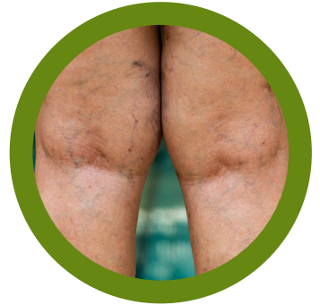
Back of the knees