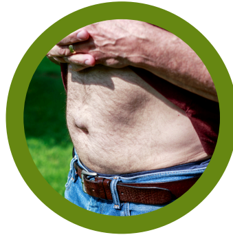
Around the waist