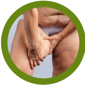
Between the legs