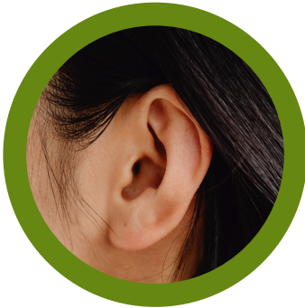
In and around the ears