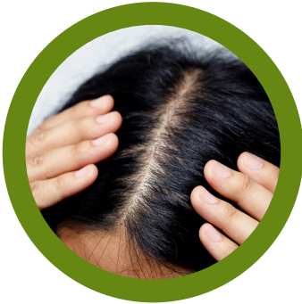
In and around the hair