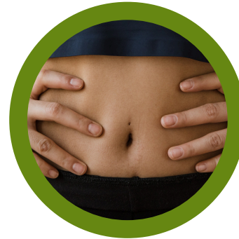
Inside the belly button