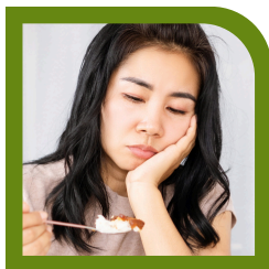
Lack of Appetite